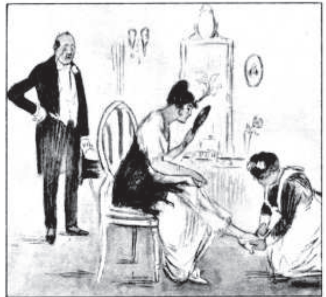
Hubby: Aren't you ready yet? Wife (with irritation): Why do you keep asking that? Haven't I been telling you for the last half hour that I'd be ready in a minute?

DIRECTIONS FROM PORTSMOUTH ABBEY: Turn left onto Cory's Lane, drive to the intersection with route 114, turn right onto 114 and almost immediately, at the first light, turn left onto Hedley Street (there is a sign to Portsmouth Business Park). A little over 1/2 mi. down Hedley Street there is a stop sign, with a second stop sign almost immediately beyond it at a T intersection. Go straight at the first stop sign and turn right at the second onto route 138 south. Go approximately 2 miles on Route 138, and then turn left on Glen Road; landmarks as you approach Glen Road are a big sign on the right just before the turn ("Daniel Chapter One") and the "Old Almy Village" directly across from Glen Road (if you reach the state police barracks you have gone too far). Go to the end of Glen Road (approximately 1 mile) and turn right onto Coelho Drive. After passing the Elmhurst School on the left, the road ends at the courtyard in front of Glen Manor House . Passengers may be let out at the door; parking is back up the hill across from the school.