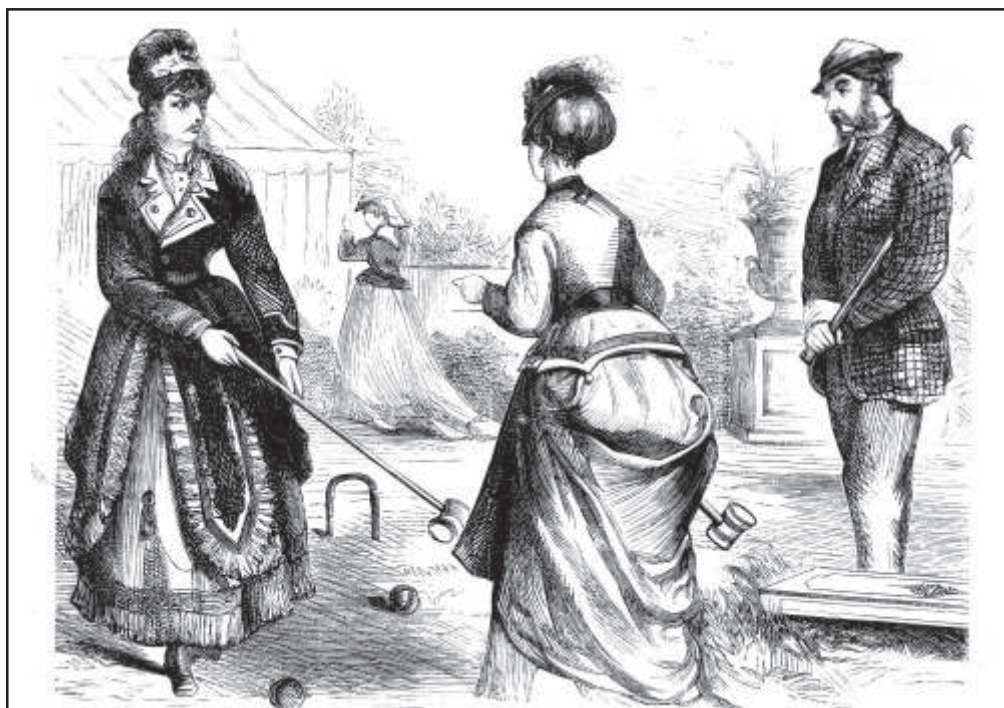
FACT VERSUS FANCY.