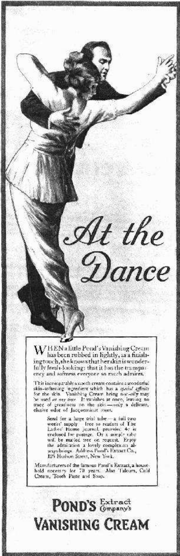
The Ladies' Home Journal, May 1915