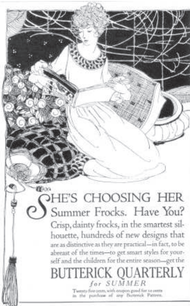
The Delineator , May 1920

-text courtesy of The Astor's Beechwood Mansion