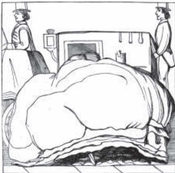
IT'S NOT "THE GETTING IN."

DIRECTIONS FROM PORTSMOUTH ABBEY: Turn left onto Cory's Lane, drive to the intersection with route 114, turn right onto 114 and almost immediately, at the first light, turn left onto Hedley St. (there is a sign to Portsmouth Business Park). A little over 1/2 mi. down Hedley St. there is a stop sign, with a second stop sign almost immediately beyond it. Go straight at the first stop sign and turn right at the second onto route 138 south. Go approx. 4 1/2 mi. on Rte. 138; 138 intersects with 138A (Aquidneck Ave.) at the Dunkin Donuts, turn onto 138A. Follow Aquidneck Ave. for about 2 miles, it eventually intersects with Memorial Blvd. Turn left onto Memorial Blvd., which bears right, and passes Newport's First Beach (on left). The carousel and ballroom will be on the left at Easton's (First) Beach. Parking is adjacent to the building.