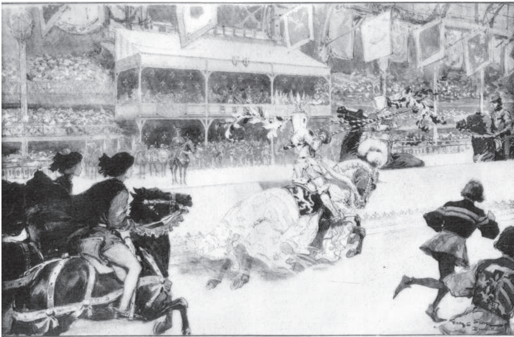
THE BRUSSELS TOURNAMENT: BREAKING A LANCE BEFORE THE BOX OF THE DUKE OF BURGUNDY.