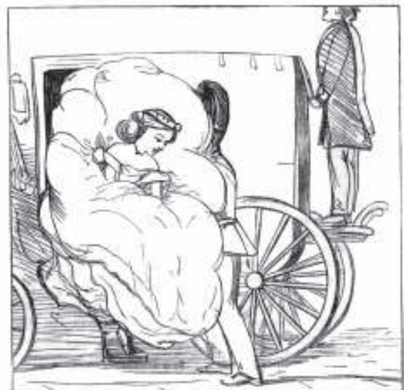
BUT IT'S "THE GETTING OUT!"