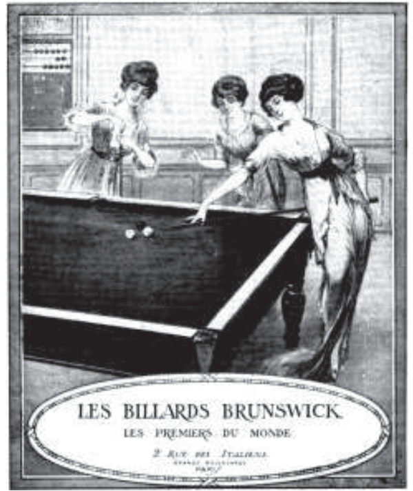
Femina, January 1, 1914

- excerpts from information provided by Glen Manor House