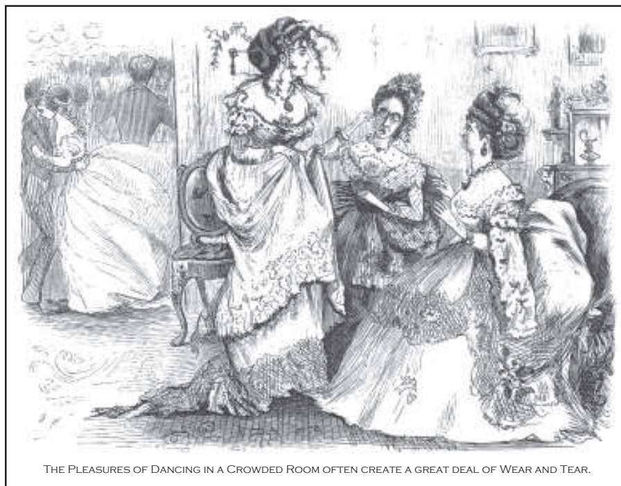
THE PLEASURES OF DANCING IN A CROWDED ROOM OFTEN CREATE A GREAT DEAL OF WEAR AND TEAR.